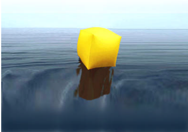
Killer Lemon™ Naval Gunnery Target balloon

Killer Lemon™ is a small adrift target (NavTGT) designed to blow and tumble across the wave surface, primarily for small guns target practice or air-to-surface gunnery practice.