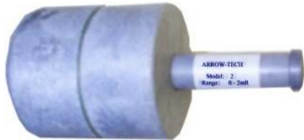
Arrow-Tech Model 2

The low energy feature has hospital applications including fluoroscopy, portable radiography and angiography.