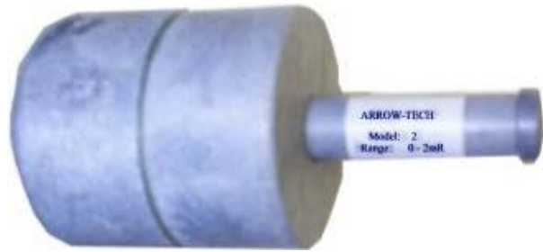
Arrow-Tech Model 2

The low energy feature has hospital applications including fluoroscopy, portable radiography and angiography.